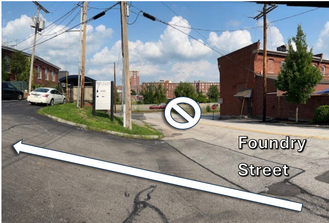
Picture Two: Our driveway off Foundry Street. Turn left just before the white sign. Our parking is on the right. If you go past our driveway to the stop sign, you've gone too far!