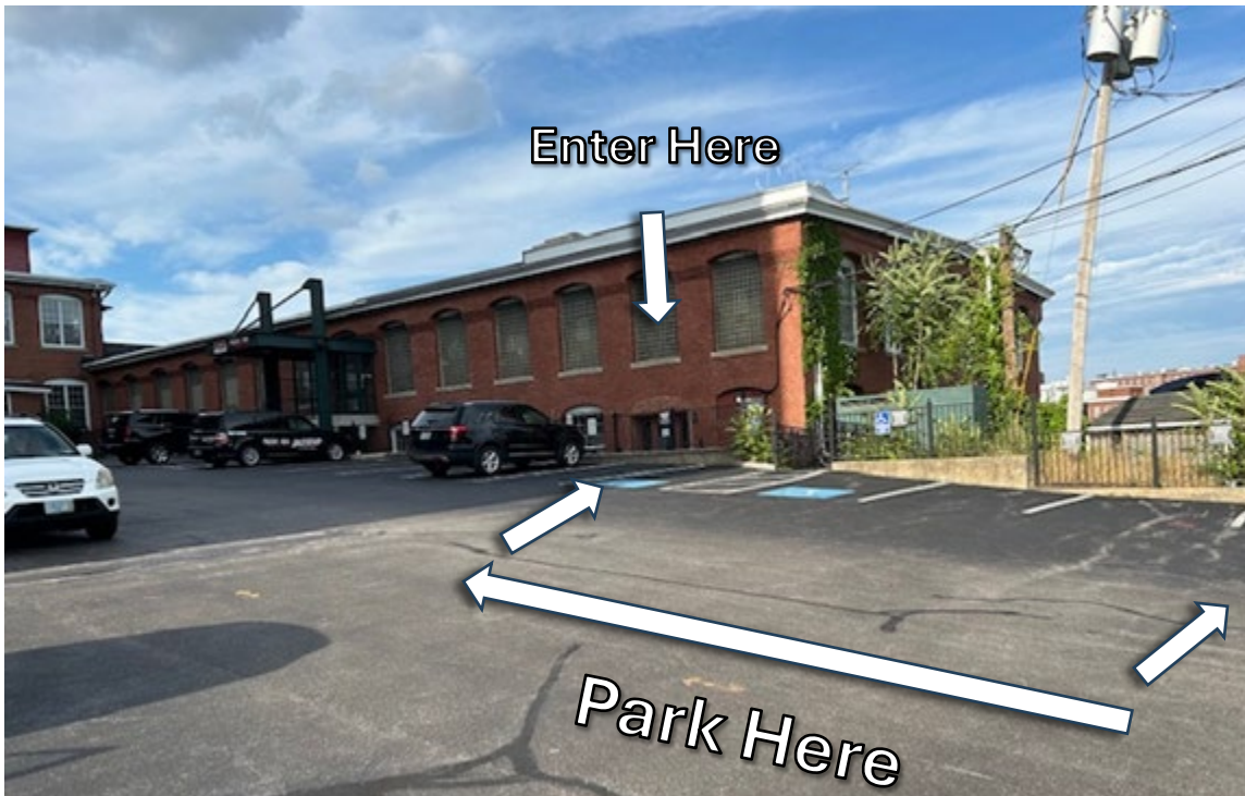
Picture Three: Immediately on the right after you turn into the driveway. Five parking spots reserved, with Moore Center Services signs. Our entrance is below the vertical arrow.