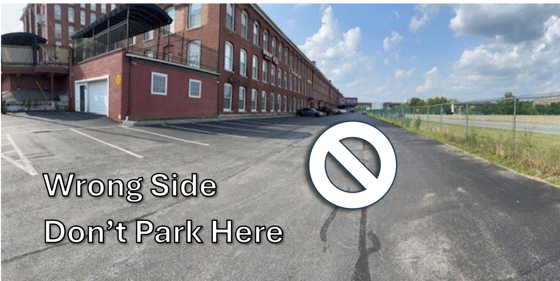
Picture Seven: The back side of the Annex. Turnpike is on the right. You went too far down Foundry Street and missed the turn into our driveway. There is no entrance to our office here. You want to be on the other side of this building.