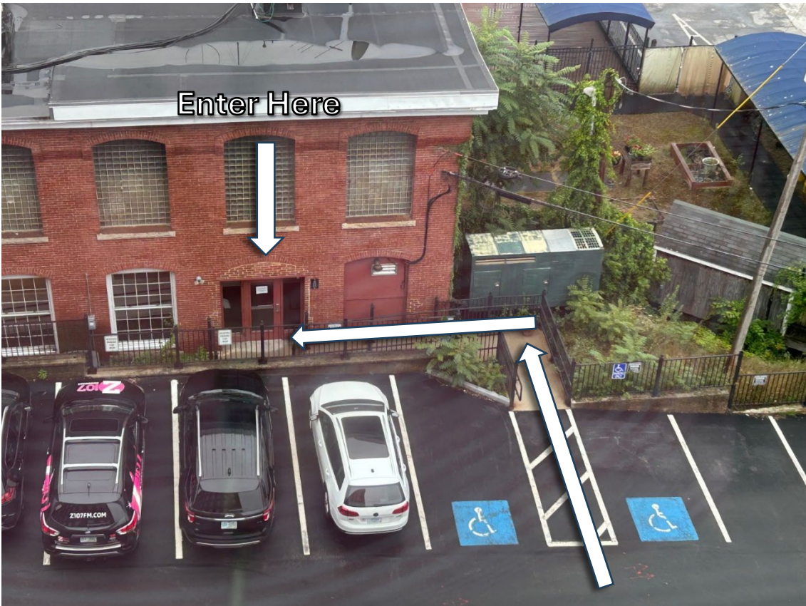
Picture Four: Overhead view of ramp and our door. WGIR radio station is to our left. Turnpike and river are behind us.