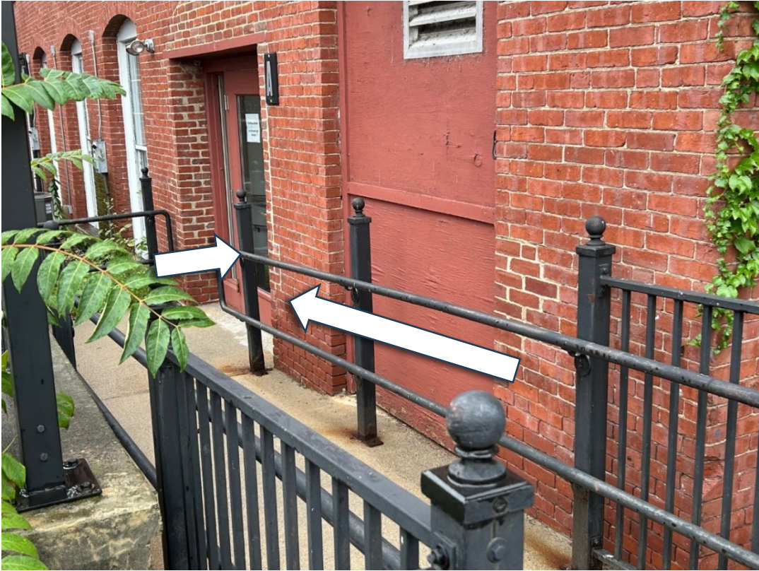
Picture Five: The ramp down to our door. Notice the "A" sign for Suite A.